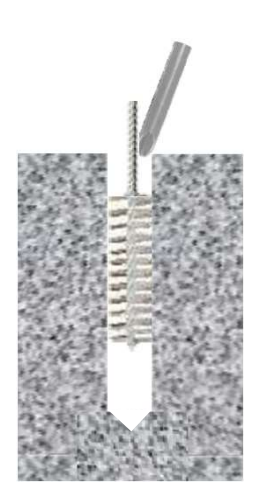
Clean hole by brushing and blowing to remove all dust and drilling debris