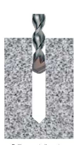
Drill correct diameter hole to correct depth