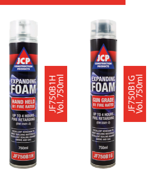
B1 Fire Stop Expanding Foam