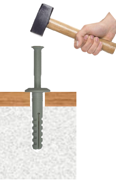
Insert Nylon Nailplug and hammer in expansion pin

JCP Construction Products, Unit 14 Teddington Business Park, Station Rd, Teddington Middlesex TW11 9BQ Tel. 020 8943 1800 Web www.jcpfixings.co.uk