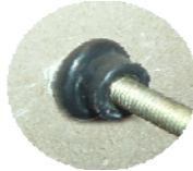
Synthetic Rubber Sleeve

Synthetic Rubber Sleeve with Brass Threaded Insert. Suitable for use in most hollow materials and occasional use in solid materials